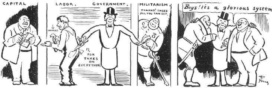
KEEPING IT IN THE FAMILY

Back by popular demand....it's cartoon time.