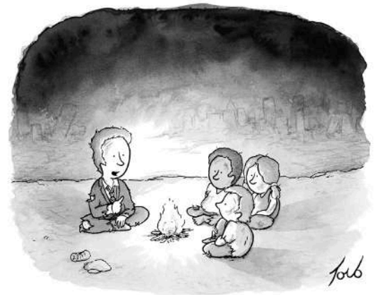
"Yes, the planet got destroyed. But for a beautiful moment in time we created a lot of value for shareholders."