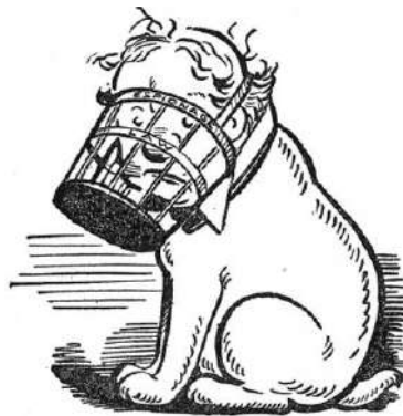
FOR THE SAFETY OF THE PUBLIC.