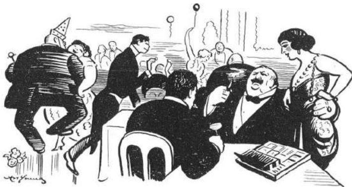
THE PROFITEER: "I'm as good a friend of labor as the next man—but there's no denying the fact that workingmen do spend their money foolishly."