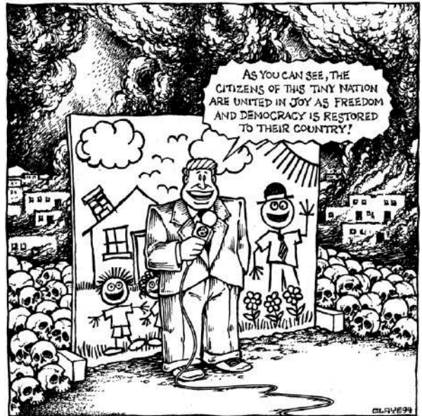
Sidewalk Bubblegum ©1994 Clay Butler